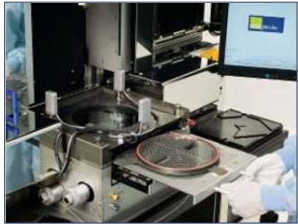
SUSS Mask Aligner MA/BA8 Gen3

SUSS MicroTec group as your preferred partner for all CMOS Imager and WLC activities.