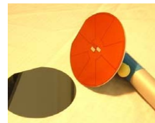
Electrostatics Chuck for Thin Wafer Handling