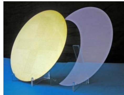
Microlens Master (left) and replicated 8" Lens Wafer (right)